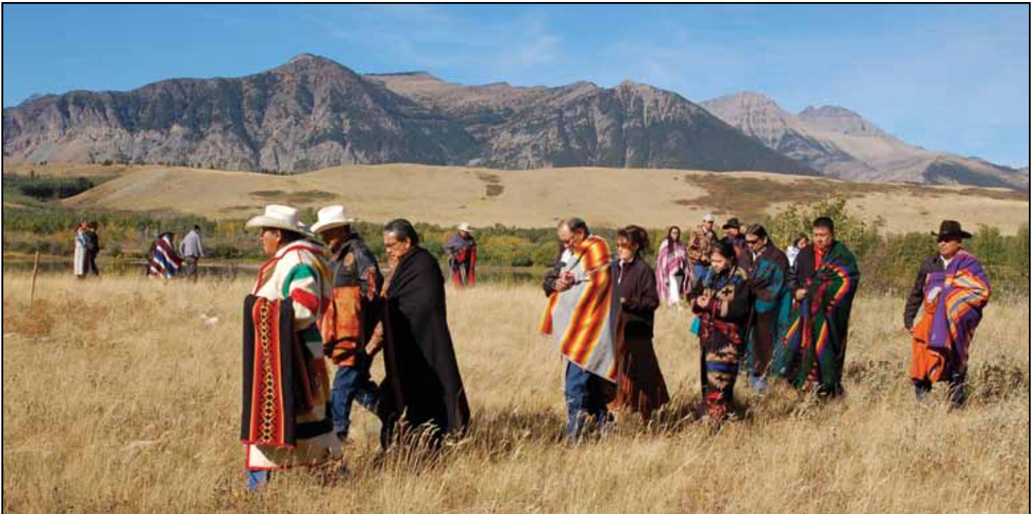
Leaders and spiritual elders from the Blackfoot Confederacy nations walk on the same ground our ancestors did. The Blackfoot Confederacy continues its strong presence in our traditional territory.