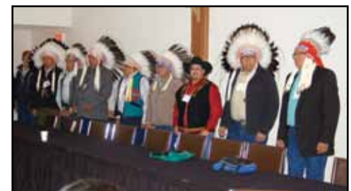
Participants gathered for opening ceremonies of the conference in Waterton Lakes.

Siksika will be hosting next year's Blackfoot Confederacy conference.