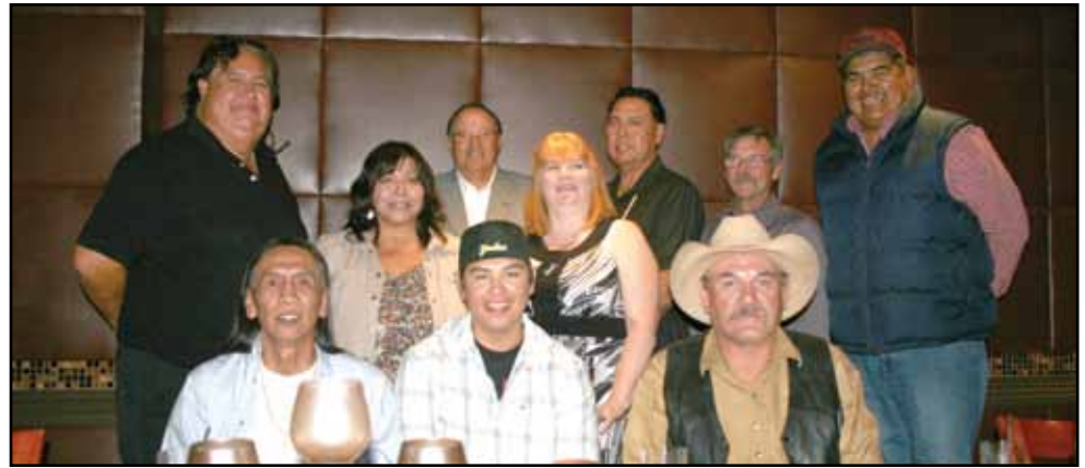
The driver program graduates posed during their ceremony in Lethbridge.