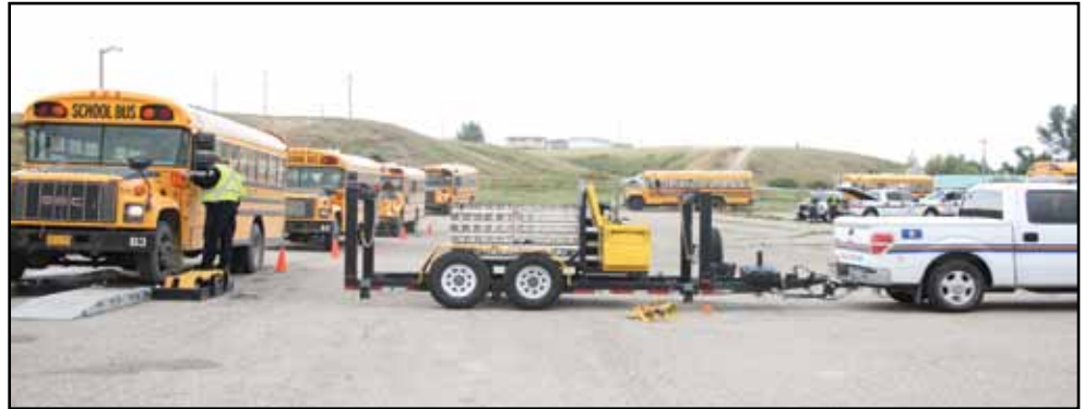
The annual safety inspection ensures safety of children.

In preparation for the new school year, the Blood Reserve School Bus Co-op and Kainai Board of Education, in partnership with Alberta Transportation's Commercial Vehicle Enforcement Branch (CVEB) had Commercial Vehicle Safety Alliance (CVSA) Inspections conducted on their buses September 13 & 14, 2011 at the Kainai Skating Rink's