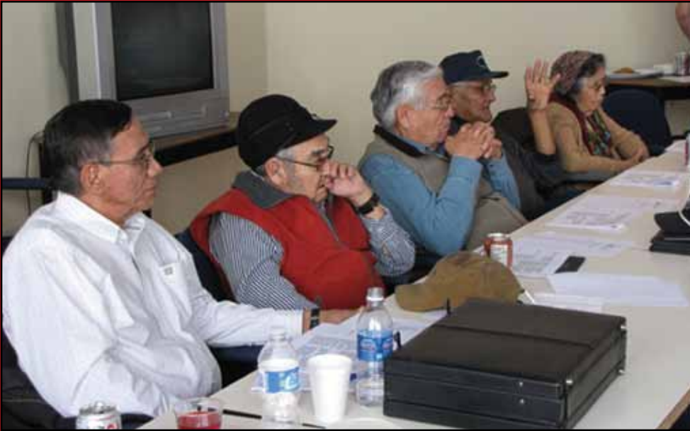
Many elders are involved in the Kainai Government Agreement process.

After 11 years of negotiations between the governments of Blood Tribe, Canada and Alberta, the Kainai Bilateral Government Agreement and Kainai Tripartite Government Agreement were initialled on July 14, 2011. The Kainai Bilateral and Tripartite Government Agreements and the Blood Tribe/Kainai Governance Law will now go out to the Blood Tribe electorate for approval by way of a referendum (vote) on December 14, 2011.