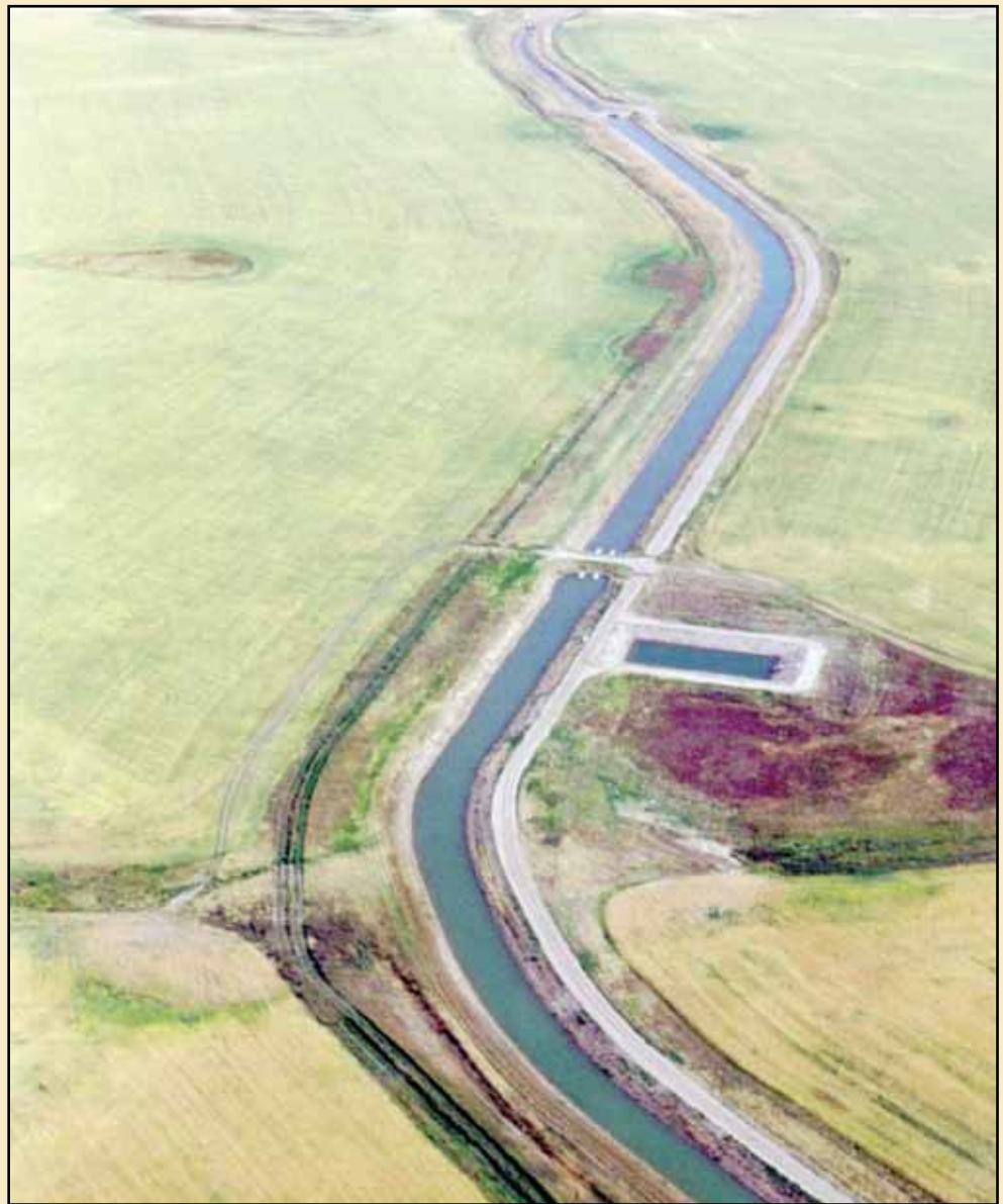
Aerial view of the canal irrigation system on the Blood Tribe Agricultural Project.