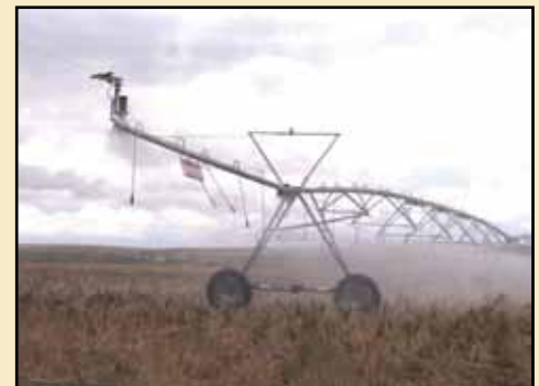
Pivots are in constant use during summer.

In closing, I invite everyone to learn more about the project. As we learn together and appreciate the diversity of this project, I am certain we will agree that BTAP could be a Model toward self-sufficiency for other reserves. We can share in the pride of this project. I ask for your continued support and prayers for another successful year.