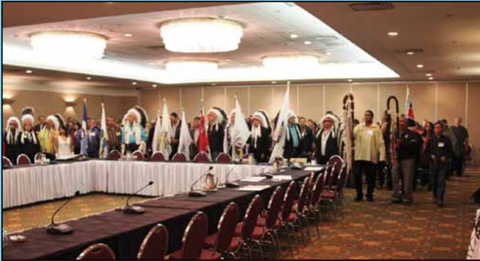
The Chiefs of Treaties 1-11 gather at treaty forum in Calgary.

Calgary, AB. - Over 1000 registered Elders, Chiefs and Delegates gathered in Calgary to affirm historic peace agreements at the 7th Annual Treaties 1-11 Gathering on September 21, 22 and 23. The assembly was hosted by the Tsuu T'ina Nation and was attended by well respected and renowned experts on Indigenous issues, Chiefs, elders and community members.