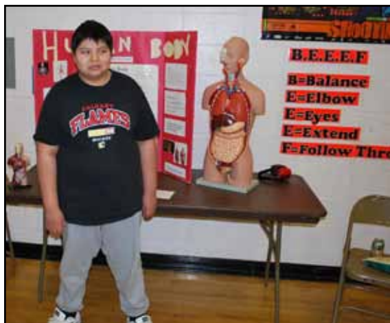
An exhibit that shows the inside of a human body in detail.