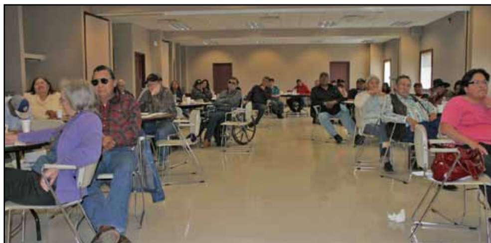
The Blackfoot Confederacy Disabilities Society was well-attended by the three confederacy tribes in Canada.

The Blood Tribe will host the next Blackfoot Confederacy Disabilities Society conference.