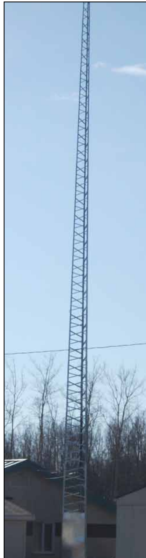
Towers such as this one are needed to reach the residents of each community on the Blood reserve.

Internet services have been available for some time through the providers bordering the reserve and the competition has been intense, the demand by reserve residents is increasing.