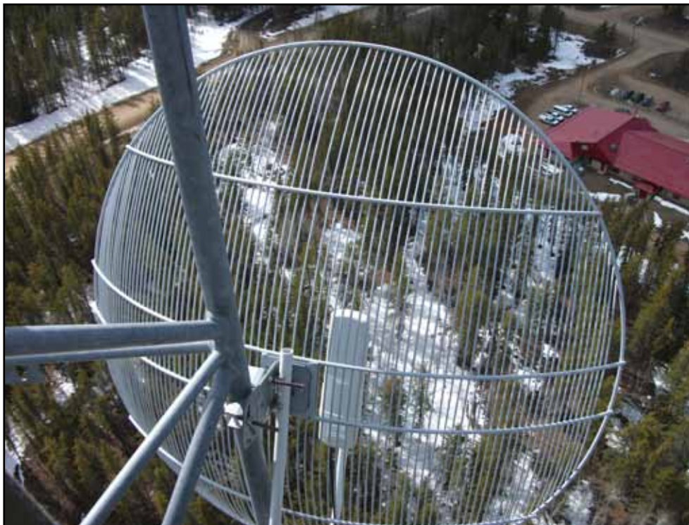
A parabolic antenna overlooks a native community that has integrated the wireless high speed internet system.

Since the development of high speed internet on the Blood reserve in 2007 and the installation of the Supernet, a Province of Alberta initiative to get all Albertans plugged in, with movement toward internet access to homes has been difficult, until now. Recent discussions between Blood Tribe communications people and First Nations (AB) Technical Services Advisory Group (TSAG) and Strategic Technology Services, an Edmonton based company, have brought forth a proposal to provide high speed internet to the Blood reserve at a lower cost than presently exists in the marketplace.