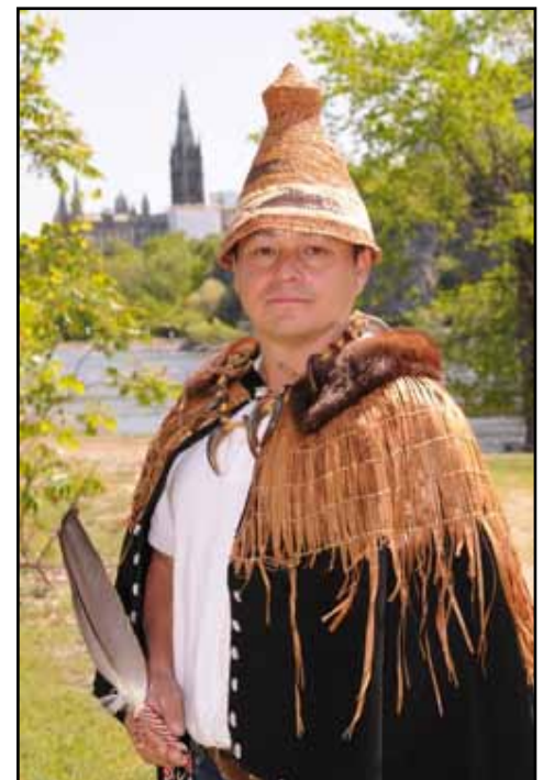
Shawn Atleo, National Chief of the Assembly of First Nations.

The National Chief says, "Many First Nations were rightly concerned about this change as we want to – and will – ensure that the Minister and government respect and maintain the unique relationship between First Nations and the Crown. We will always work to ensure the constitutionally protected rights of First Nations are respected, the responsibilities to First Nations are upheld and our interests receive specific attention and action."