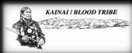
COVER: Spectacular view of the Blood reserve looking west to the Rocky Mountains taken from the Buttes.

Published by the authority of Blood Tribe Chief & Council Box 60 Standoff, AB T0L 1Y0 ph: (403) 737-3753 FAX: (403) 737-2785 visit our website for more... www.bloodtribe.org