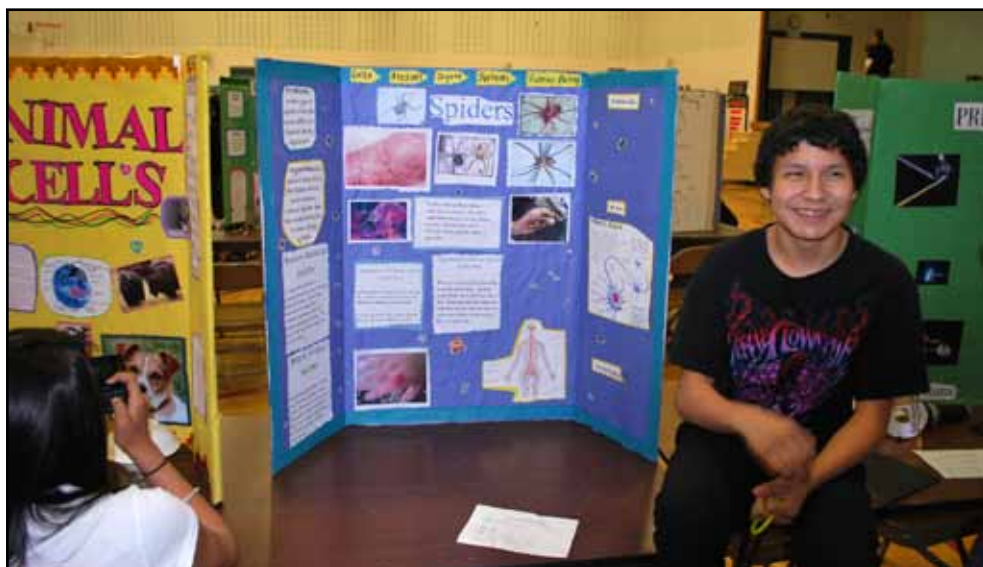
Spiders are the focus of this young scientist.