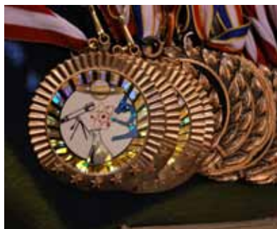
A close up of the medals that were given to the creators of the winning exhibits.