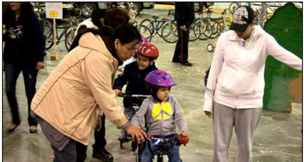
The young students had a fun time at the Bike Rodeo. All the students received bike helmets.