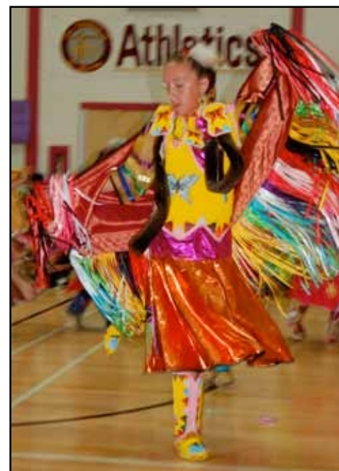
A young fancy dancer is proudly showing her style to the people of West Lethbridge.