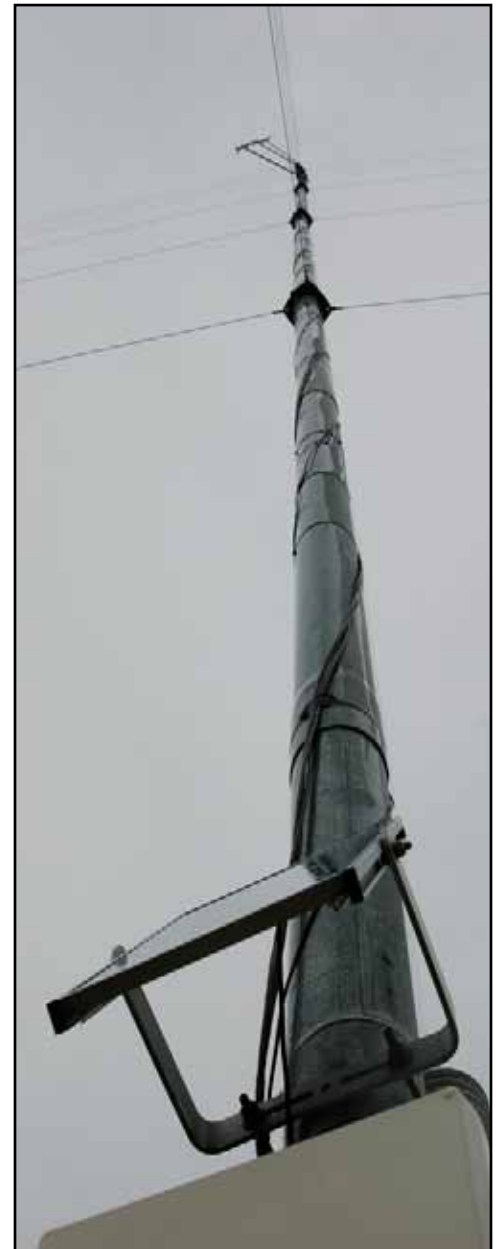
This wind data tower is powered by solar panels.

The Blood Tribe and TransCanada are working on the commercial arrangements for the wind project and hope to have these discussions concluded later this year and will then communicate the result of these discussions to the Blood Tribe community. In the meantime, planning on the project will continue with all the various internal groups and departments involved in the planning like Blood Tribe Economic Development, BTAP, Lands, BTEST, and the Traditional Land Use department. In the coming months we will continue to provide an update on the project including information on the types of employment opportunities that the project will create.