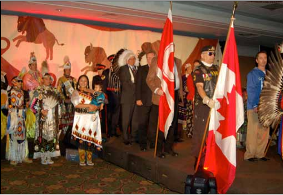
Grand entry at National Aboriginal Day, Calgary.