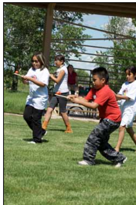
The children had a fun afternoon filled with many activities.