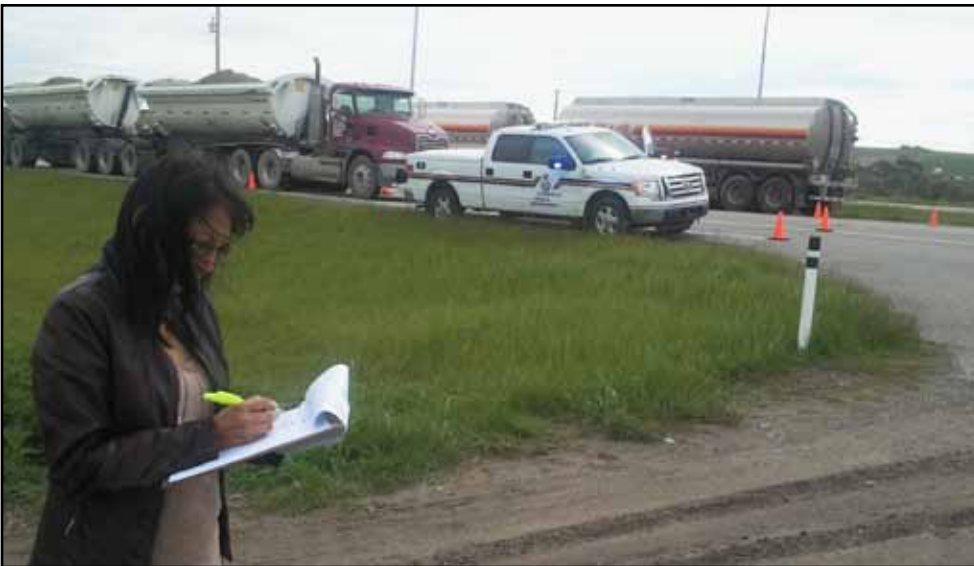
Over 600 vehicles were stopped and checked during the traffic safety initiative.