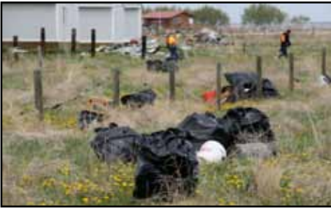
The volunteers collected many bags of garbage in cleaning up townsite.

A group of approximately fifty concerned residents of the Stand Off townsite joined together to help make their community a cleaner place to live. With the encouragement of Charlie Fox, community development coordinator, and other representatives from the community and tribal departments, the participants who registered to become involved in the clean up were then placed into groups. Each group was then placed in a specific zone as a measure of keeping the clean up activity organized.