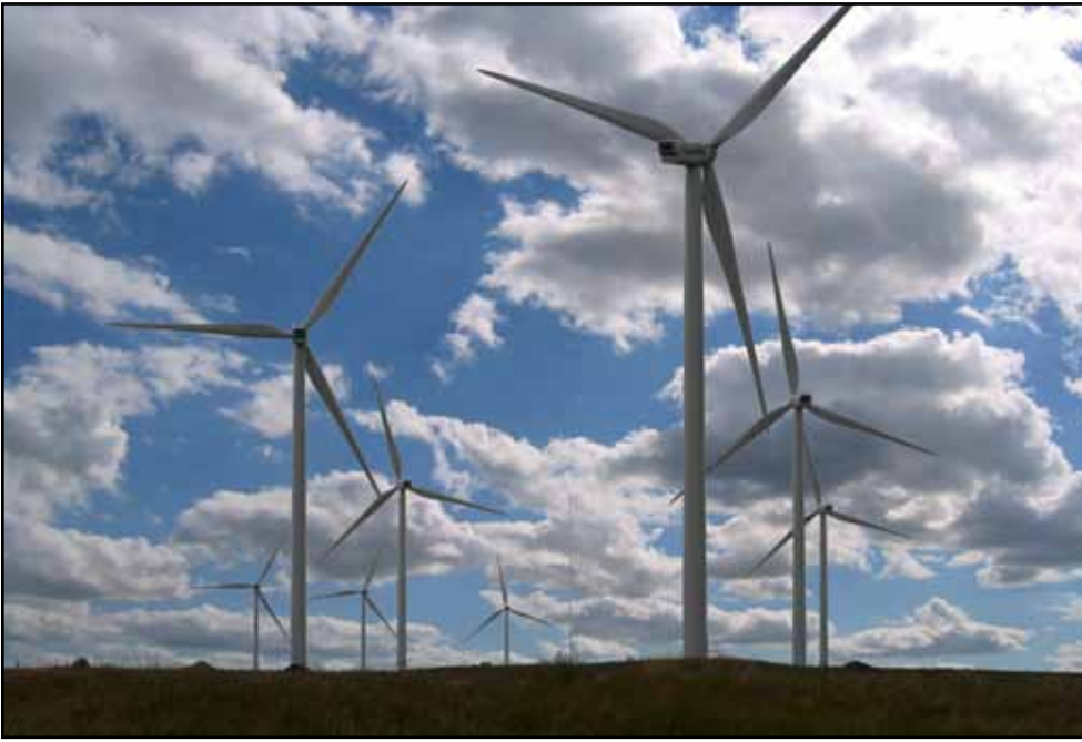
The strong winds of southern Alberta will be more than enough to keep these turbines spinning.

acid rain or climate change. It leaves behind no hazardous or toxic wastes and uses no water. Wind energy, as an alternative to fossil fuel electricity generation like coal fired electricity, is plentiful, renewable, widely distributed and produces no air emissions at all including no greenhouse gas emissions during operation.