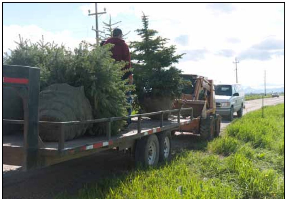
The 30 trees planted in Lavern community was performed by many volunteers.

The trees will be planted on the north side of the highway from the Aahsopi school entrance west to the powwow dance arbor.