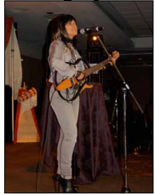
A performance by Buffy St. Marie.