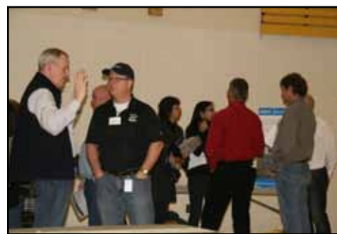
Oil/gas representatives meet with tribal members.

Barter said there are basically two regulatory bodies keeping a watchful eye on all drilling