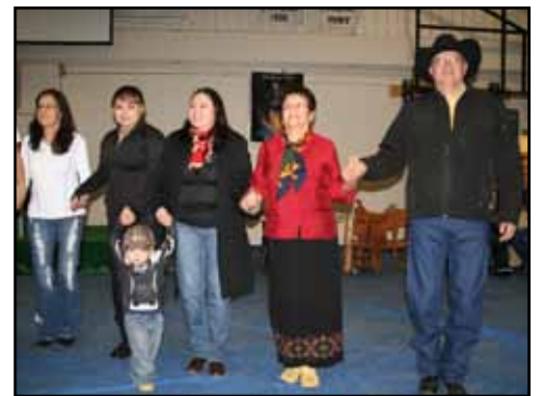
A number of family and friends enjoyed the round dance and tribute ceremonies.