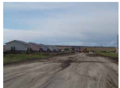
New housing construction will utilize highly efficient materials as a cost-saving measure for homeowners.

Tribal members interested in the housing initiative can call Winston Day Chief at 403.737.3988.