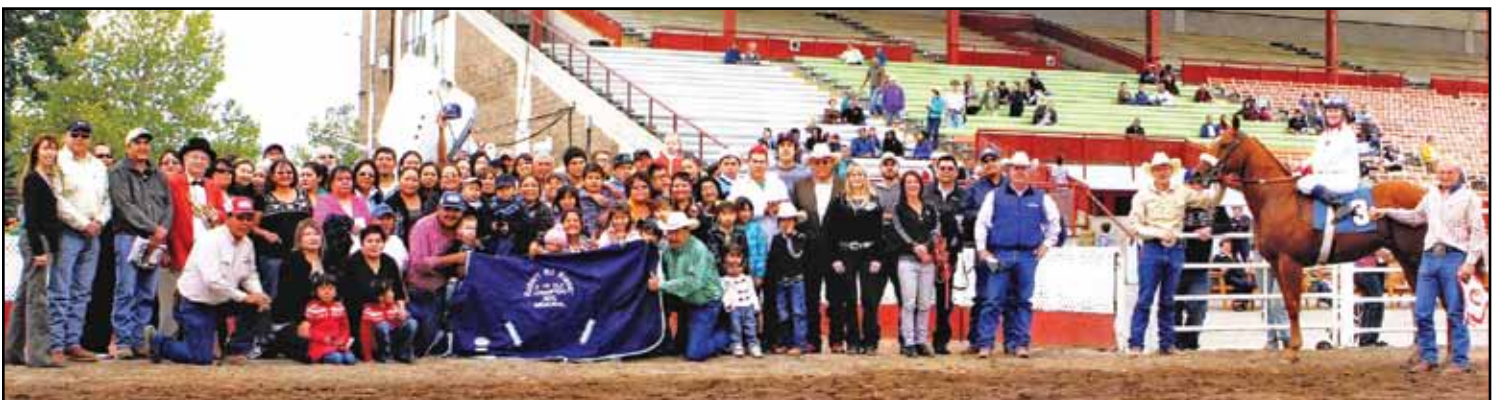
The No Runner clan and family members gathered for a photograph with the winning horse and owner.