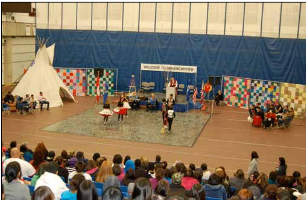
Opening ceremonies at Dreamcatcher Conference 2010 at MacEwan Hall in Edmonton.

It was a celebration of heritage, arts and history with a touch of class. This year's DreamCatcher Conference 2010, hosted by the MacEwan University in Edmonton, was well-attended by aboriginal youth across Western Canada.