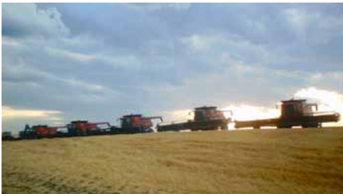
Combines used in the South Dakota combine training

In order to ensure that OEF employees were prepared for the busy harvest season, combine training was done with several OEF employees over the summer months. OEF employees worked with a custom combining crew in South Dakota using the same combines used during harvest here. This opportunity provided the employees with experience operating these units and a comfort level that allowed them to face any challenges that may have come up.