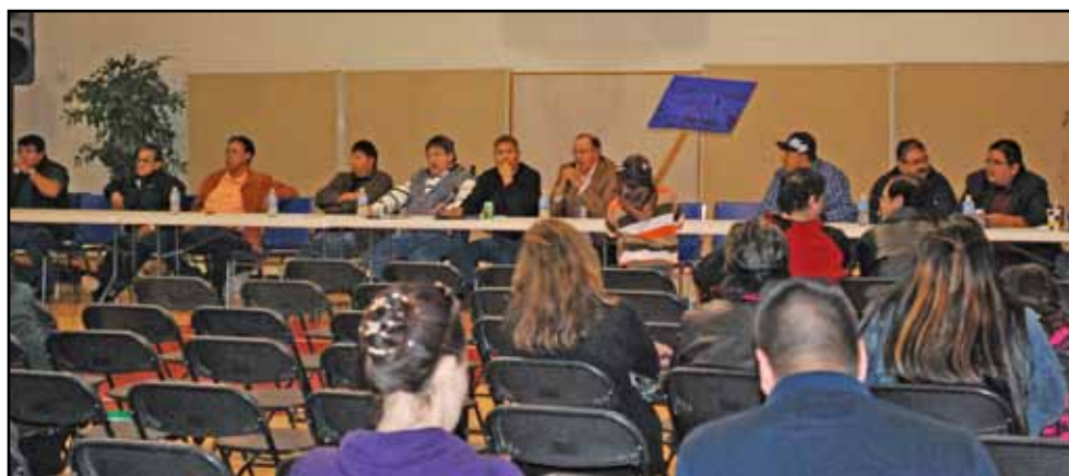
A second community meeting was held in Lethbridge for urban tribal members at the Medicine Tree Center.