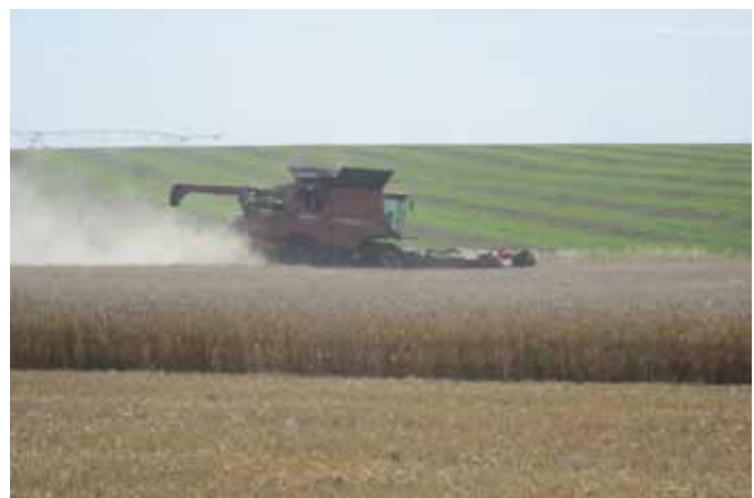
OEF Harvest Operations at Blood Tribe

Harvest for OEF began this fall on August 27. Barley crops were the first fields combined. If the weather cooperates, it is expected that OEF will be completed harvesting at the Blood Tribe by the end of October.