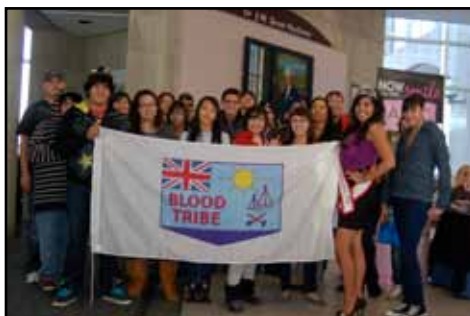
Youth from the Blood Tribe proudly stand by their flag.

The conference continues to offer opportunities for youth to share their talents with others attending the conference. There were groups from the Kainai High, Cardston High, Catholic Central and Fort Macleod high schools.