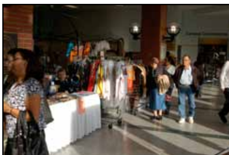
One of the many vendors at the conference.