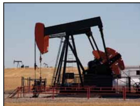
One of the existing gas wells on the north end of the reserve.