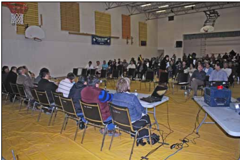
Chief & Council met with members of the Blood Tribe to discuss details of the Oil and Gas agreement at the Saipoyii Old School Gym on Wednesday, October 20, 2010.

Further details will be disclosed when they are released.