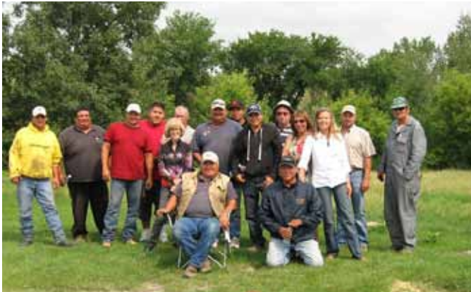
OEF Blood Tribe crew at the pre-harvest BBQ on August 17

OEF currently has a total of 62 employees that are helping to bring in the harvest from the land leased across Saskatchewan and Alberta. 20 of these are employed at the Blood and 18 employees are Blood Tribe members.