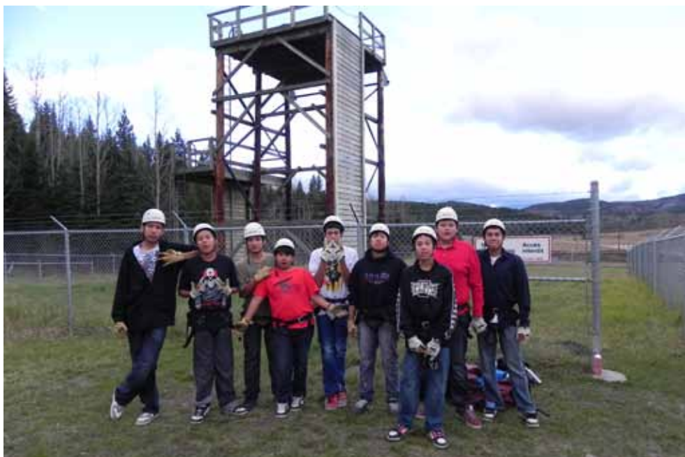
The Blood Tribe cadets stand in front of the 15 foot wall they rappelled down as part of their training.