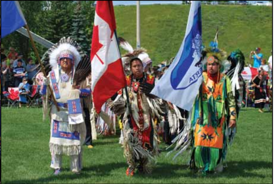
The Cardston powwow attracted a number of drum groups, dancers and visitors to the annual event.