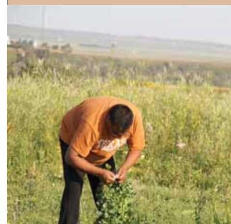
Garden staff checking out vegetables.