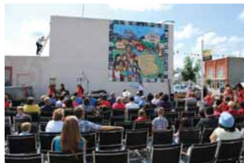
Many people were on hand at the mural unveiling.

few words in honor of the occasion: 'This is an event I will never forget.'