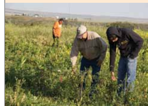
A fine crop for this year's garden.

to begin offering healthy foods for our people."