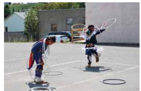
Young hoop dancers show their stuff.