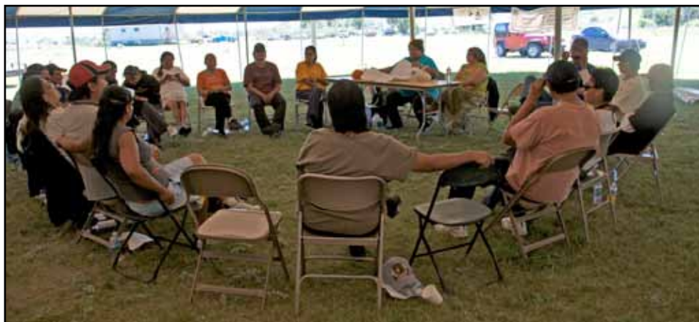
Participants of the camp were involved in many activities during the week.

“I really hope for the best for them and hope they get something positive from this camp. I want them to hold their heads up and to be proud of who they are”. - Roger Hunt