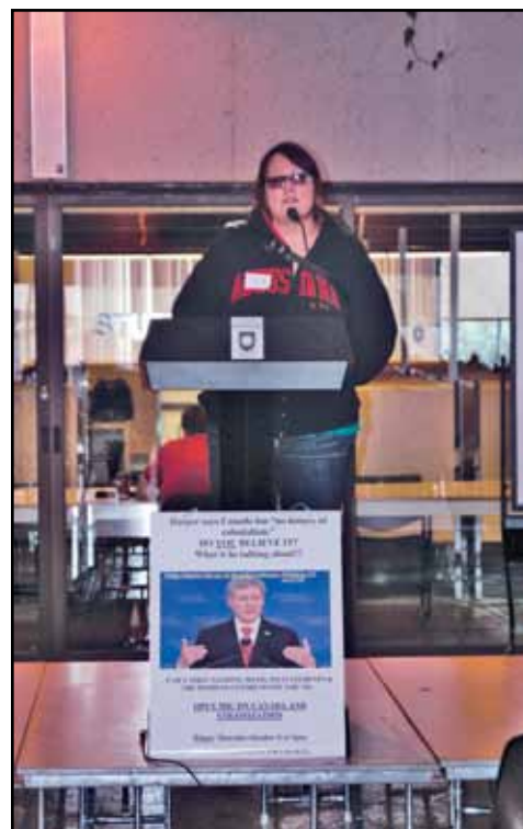
A number of concerned U of L students voiced their opinions during a recent forum on campus.

Assembly of First Nations National Chief, Shawn Atleo, responded to Harper's comments on the AFN website. "The Prime Minister must be held to the highest standard especially when speaking to the international community. There is no room for error. The current line of response from federal officials that the Prime Minister's remarks were taken 'out of context' is simply not good enough for someone in his position. The Prime Minister's statement speaks to the need for greater public education about First Nations and Canadian history. It may be possible to use this moment to begin bridging this gulf of misunderstanding. The future cannot be built without due regard to the past, without reconciling the incredible harm and injustice with a genuine commitment to move forward in truth and respect." A petition letter requesting an apology was made available to be signed after the forum and was sent to the Prime Minister.