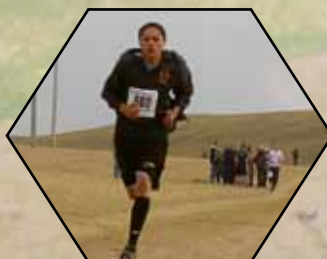
The Kainai High School played host to the 2009 South Zone Cross-Country Meet at the north-end of the Blood reserve on October 7...see page 11