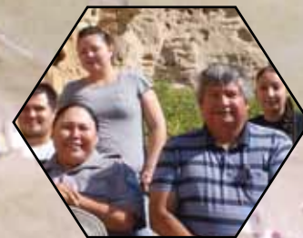
Blood Tribe Employment & Skills Training Youth Work Experience Students enrolled in the Traditional Environment & Cultural Component course offered by the Red Crow Community College will share cultural...see page 13