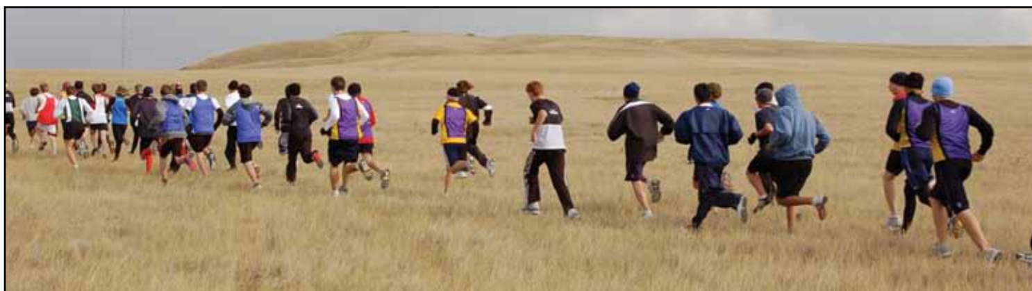
The cross-country course situated at Weasel Fat Flats proved to be a worthy challenge for the runners who braved the cold temperatures and rough terrain during the recent south zone cross-country meet.