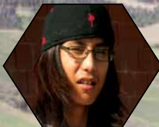
He is the youngest Indian Rodeo Cowboy Association (IRCA) Bull Riding Champion to qualify for Las Vegas...see page 9