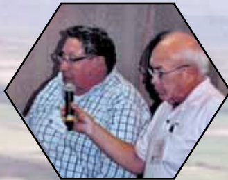
Members of the three-person commission, that were mandated to seek truth and reconciliation for residential school survivors, met with elders and survivors September 23 -24... see page 7