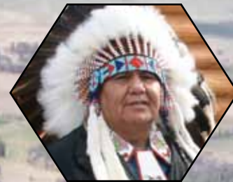
A skills training project on the Piikani Nation is instilling a fresh wave of optimism in developing job skills for Peigan members seeking a possible career in the trades sector...see page 8