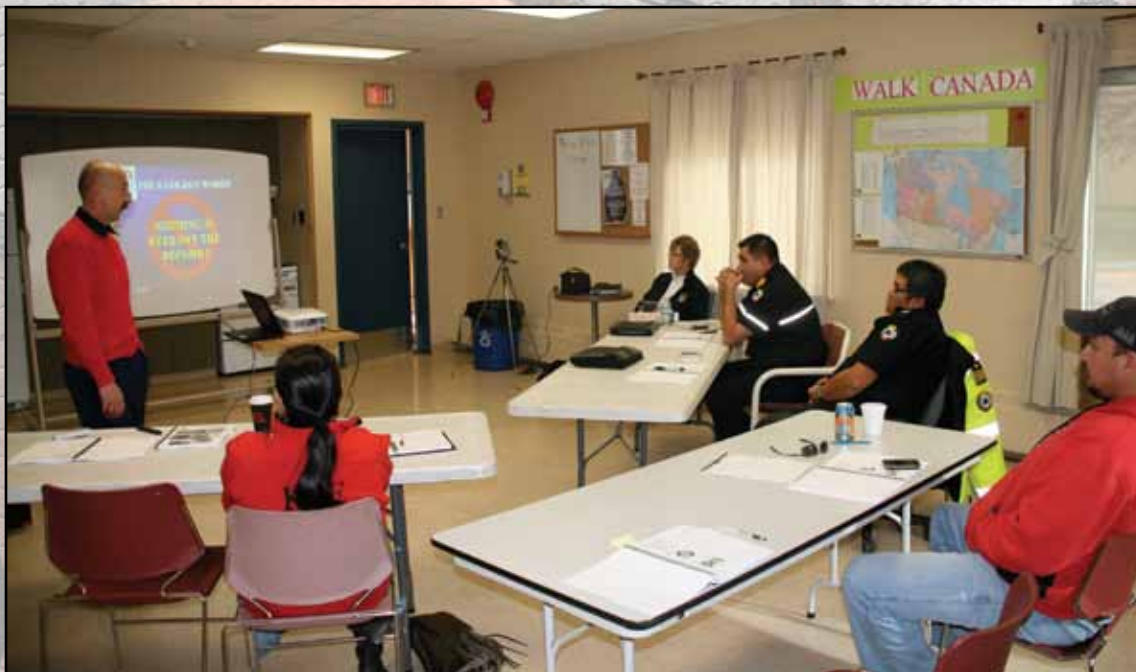
Members of the Blood Tribe disaster services attending the information session.

For more information on how to protect you and your family from the spread of the H1N1 virus, visit FightFlu.ca or contact your local health centre.