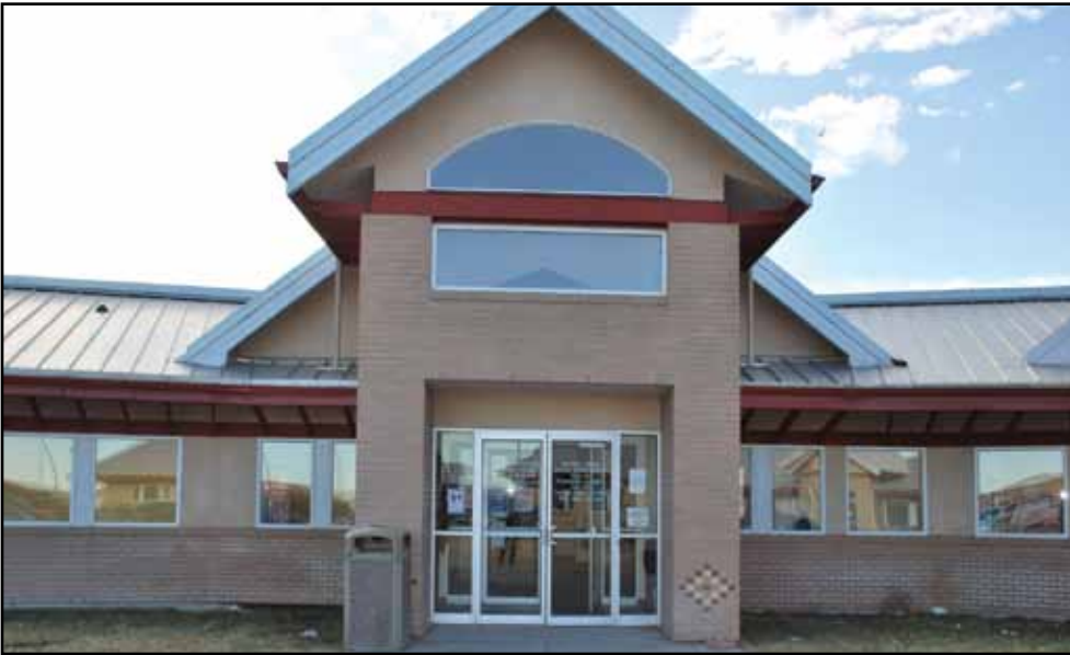
The Blood Tribe Human Resource building houses the offices of the Social Development Department.

One of the biggest departments within the Blood Tribe Administration is Social Development which endeavors to meet the needs of our people. In an ideal situation, each member of society is responsible to manage their own affairs and maintaining themselves according to their personal resources. However, there are times when the need arises to seek alternative measures in meeting the needs essential for daily sustenance.