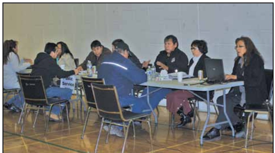
Members of the tribe met with the Public Services Pillar to discuss their concerns.