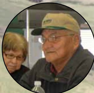
Years of experience and a lifetime of knowledge by Blackfoot elders are benefiting a younger generation of students... see page 10