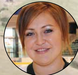
Her university studies are a priority... see page 13