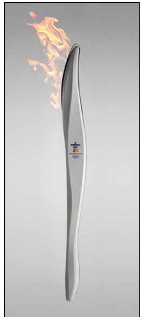
The 2010 Olympic Torch