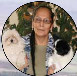
Prior to the arrival of the horse, one of our prized possessions was the dog... see page 6