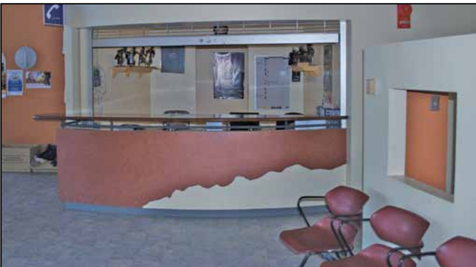
The waiting room of the Social Development office.