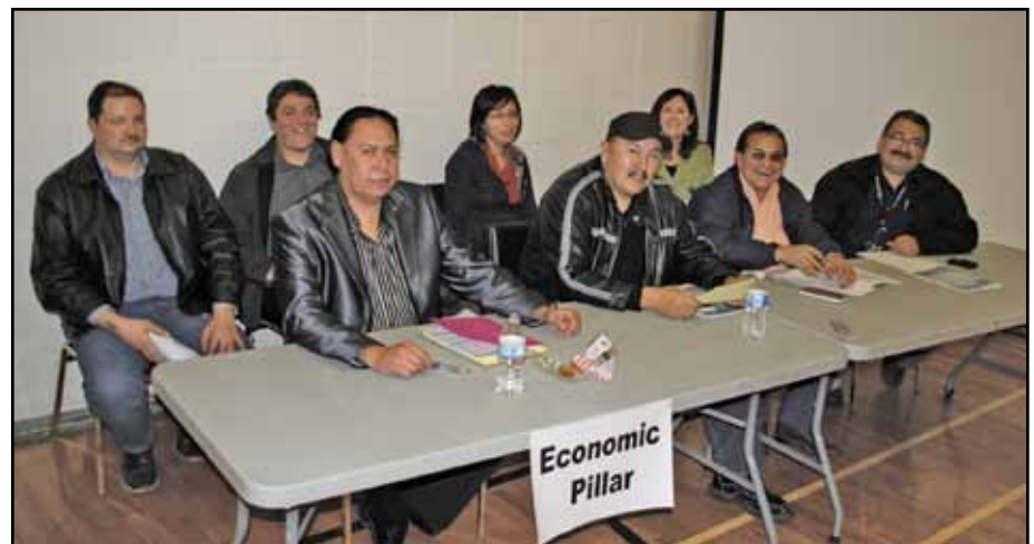
Members of the Economic Pillar and many of the tribal technicians were available to the people.