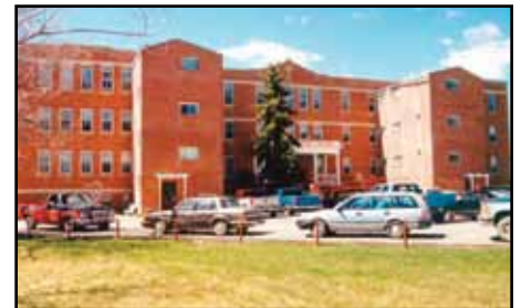
Red Crow College campus on the Blood reserve.

The Kainai Studies initiative hopes to bring elders into the learning institution as part of their program by offering this extraordinary component to students.