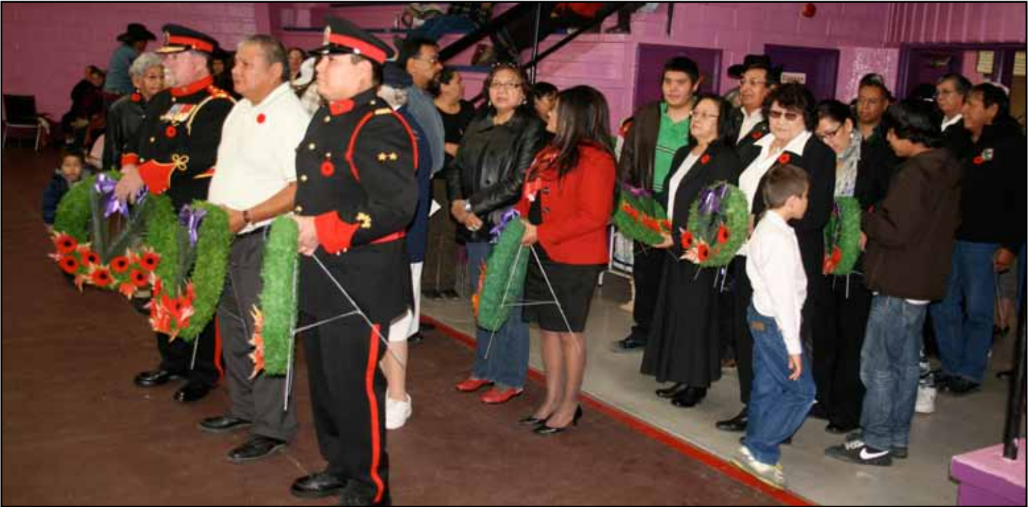
Family members and relatives of our war veterans prepare to begin the Remembrance Day ceremony with a grand entry.

Each year, our war veterans are remembered on a day designated to pay tribute to their tremendous sacrifices so that we could enjoy the many freedoms we, on many occasions, take for granted. On November 11 of each year, Remembrance Day is celebrated in respect of those who left the comfort of their homes and surroundings to play their part in protecting their people. For many, the price of serving in one of the many world conflicts was costly. Thousands