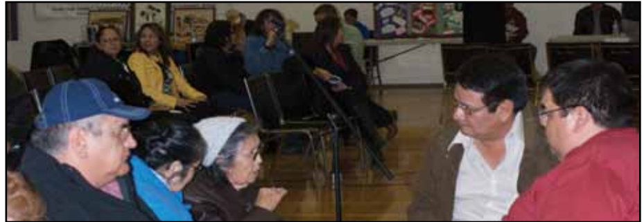
The Blood Tribe Administration directors and entity managers were on hand to listen to the concerns of the people.

After the budget and audit presentation, the meeting room was separated into three areas in which the three pillars (Tribal Government, Public Service, Economic Development) were represented by the committee members, directors and technicians. This process gave tribal members the opportunity to meet with each pillar to ask questions or to ask for answers to some of their concerns. Also, the directors and entity managers went into the seating area to meet with people who wanted to ask questions on a more individual approach.