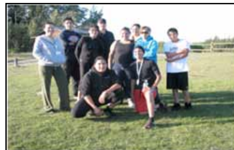
CFT7 hosts annual youth entrepreneurial camp at Nakoda Lodge