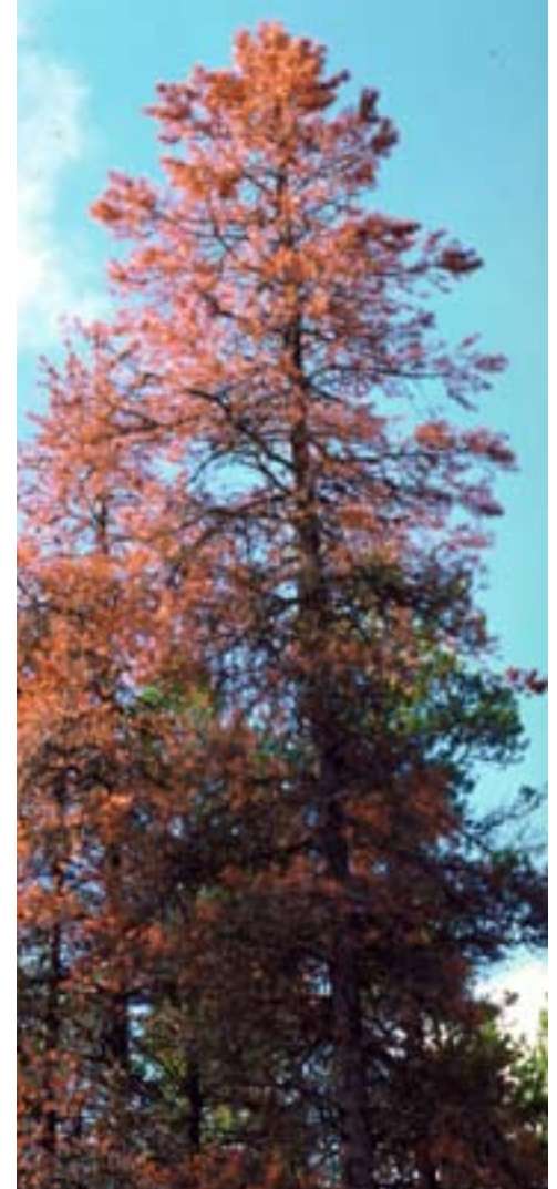
Pine tree showing effects of beetle attack.