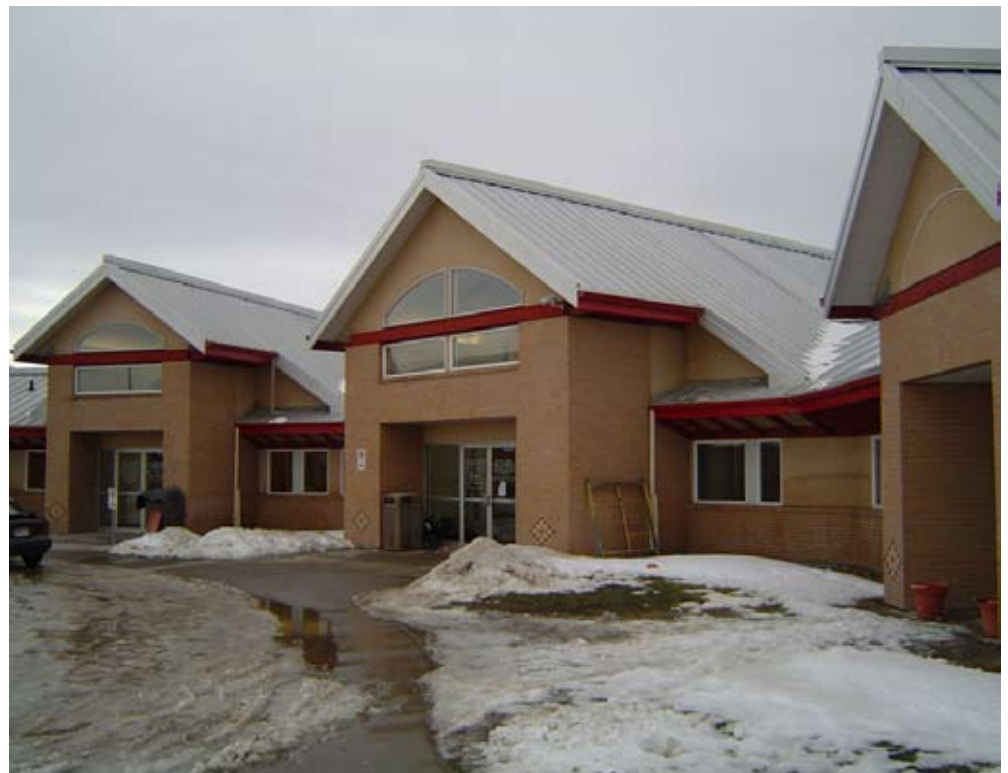
Human Resources offices in Standoff, enhancing opportunities.

The Integrated Service Delivery program has been mandated to assist clients utilizing existing resources and through collaborative efforts to find solutions. A whole new approach is being taken by including the front line workers of the various departments in the structuring of an innovative program which will fulfill the mandates identified by the Integrated Service Delivery Program.