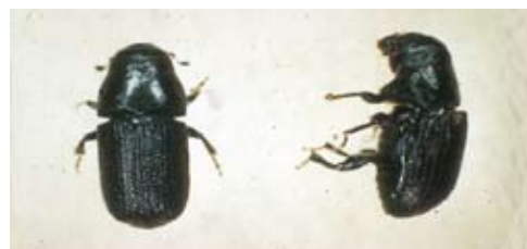
Mountain Pine Beetle