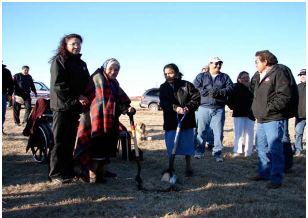
Laverne community members turning sod for new arbor.